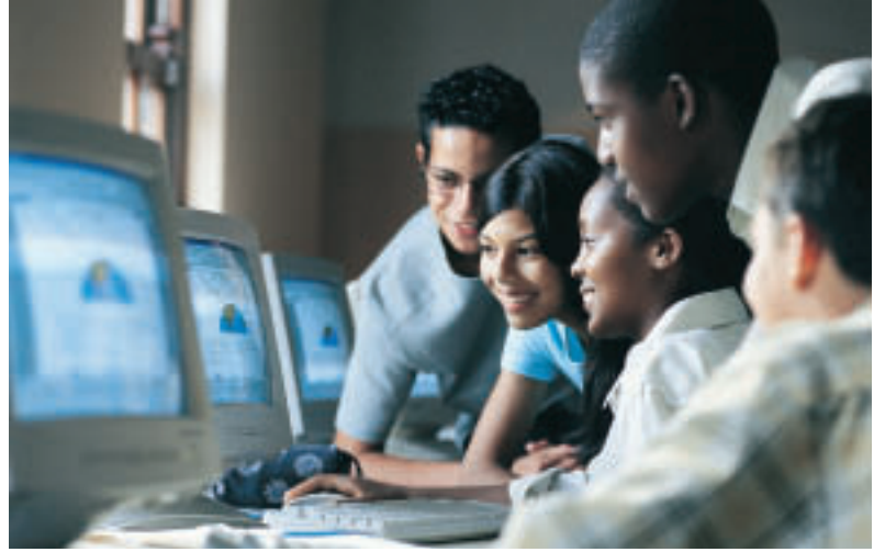
IT is an important part of the crux programme

Perhaps the boldest step, though, has been the development of YFC’s new resources for use in RE